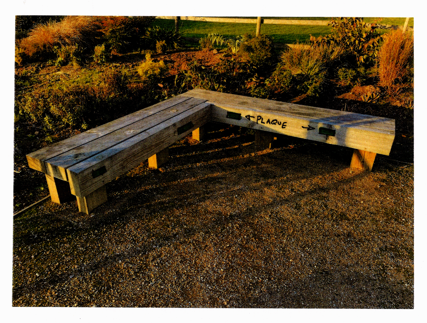
Typical example of a bench constructed from railway sleepers